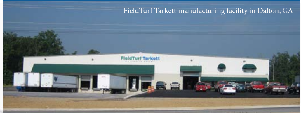
FieldTurf Tarkett manufacturing facility in Dalton, GA

FieldTurf Tarkett is the largest entity in the sports surfacing industry and provides unparalleled leasing capabilities, engineering and manufacturing resources. In addition to its world-renowned FieldTurf and Prestige brands of artificial turf, FieldTurf Tarkett provides an equally impressive range of products that includes synthetic and hardwood basketball, volleyball and gymnasium flooring, squash and racquetball courts, floor protection and covering systems, and weight room flooring. Also in the range of FieldTurf Tarkett products are indoor and outdoor running tracks including the high performance 'Le Monde' track system, playground surfacing, and a complete range of tennis and golf surfaces.